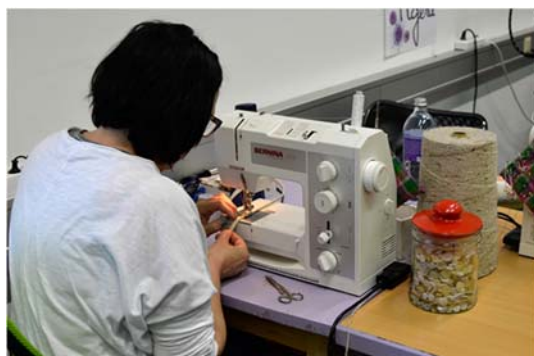
Figure 4: Woman working in the studio of “akzente Hand : WERK”

In addition to employment costs, parts of the cost for equipment (e.g. new sewing machines) for a sewing workshop were financed by LEADER funding from the LAG “Lipizzanerheimat”. The other furnishings required for the workplaces were bought second hand by akzente. The raw materials for the handicrafts, like textiles and fabrics are mostly remnants and donated by the local population or companies. Together with bottoms and zippers they are upcycled to new workpieces. To sum up, the project created new jobs for long-term unemployed women over 50 years in the region and beyond this, it tries as social enterprise to contribute to economic sustainability through re- and upcycling of textiles and develops new creative products for different target groups (dementia sufferers, tourists, ...).