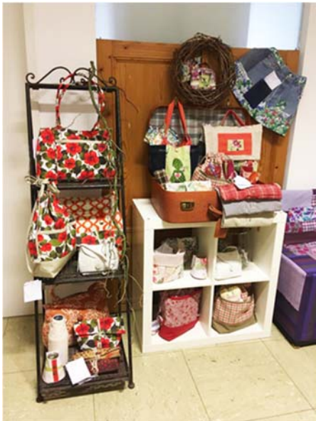
Figure 6: The big variety of products of “akzente Hand : WERK”