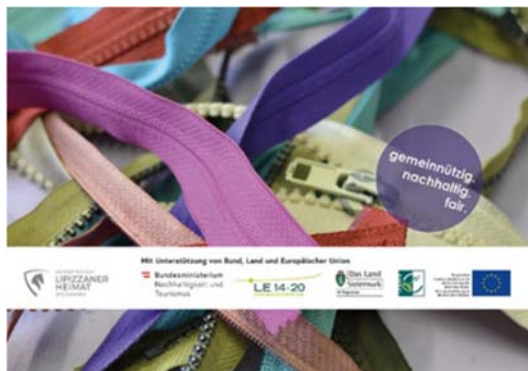
Figure 3: Leaflet of the project “akzente Hand : WERK”