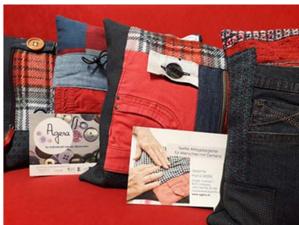
Figure 5: Motoric cushion for elderly people with dementia

Moreover, the female operators of the project are co-operating with different institutions, such as the Labour Market Service in Voitsberg and the LAG Management “Lipizzanerheimat” as well as with other organisations, such as the association for people with dementia or the high school for media in Deutschlandsberg. These cooperation activities enable the development of innovative and valuable products. An important product line manufactured by “akzente Hand : WERK” are so-called "Agera"-products, which are produced especially for people with dementia and ready for use in geriatric care institutions. They are created in collaboration between the job trainer of “akzente Hand : WERK”, the master tailor, and representatives of the association for people with dementia. These products like motoric cushions or dementia figures underwent a pre-test before the production started in the studio (see Figure 5).