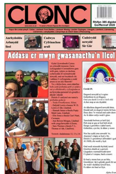
The front page of Papurau Bro Clonc, serving the Lampeter area, Mid Wales

Recently, there have been innovative efforts to develop a digital platform . Bro 360 is a new partnership between the Papurau Bro and Golwg, the most widely published Welsh language magazine in circulation.